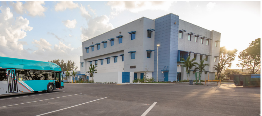
Palm Tran South Bus Expansion, Delray Beach, FL