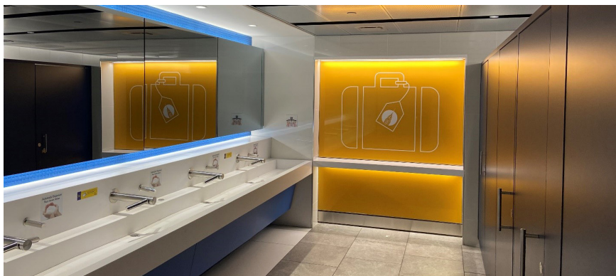
JFK International Airport Bathroom Renovations at Jamaica Station, Jamaica, NY

Abu Dhabi International Airport Etihad Terminal 3, UAE $326,708,000