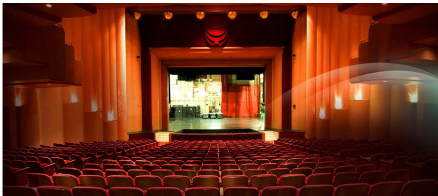
Wortham Center Stage, Houston, TX