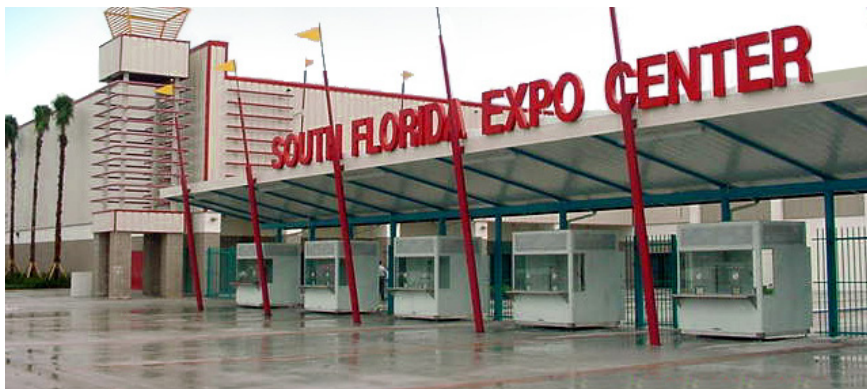
South Florida Expo Center, West Palm Beach, FL