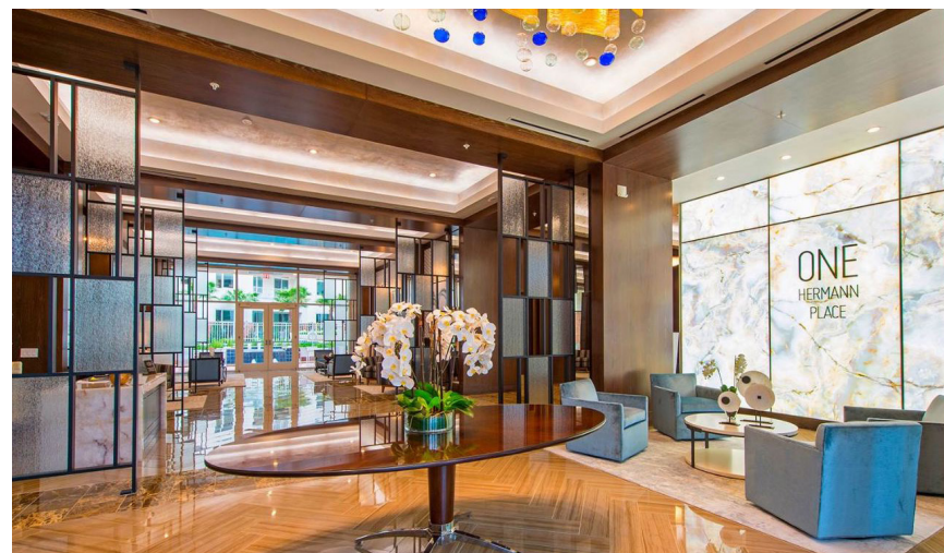
One Hermann Place, Houston, TX